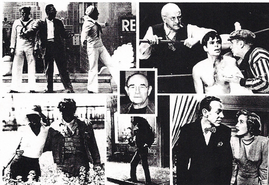
Stanley Donen (center), seen with Frank Sinatra and Gene Kelly rehearsing "On the Town" (top left), directed such memorable films as (clockwise from top right) "Movie, Movie," "Royal Wedding," "Singin' in the Rain" and "Two for the Road."

Tonight Donen will finally receive Hollywood's highest acclaim for his work